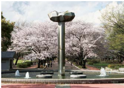
Monument fountain at Flower field

This park was developed under a policy of using a part of former military bases for parks. Development was carried out considering improvement to the living environment for residents, the need for exercise facilities, and function as an evacuation center in case of disaster. The park has the 300-meter long cherry blossom street, "Flower-promenade," and a full range of sports facilities for jogging, baseball, tennis, and soccer, as well as playground and waterside areas. Also, ten different sculptures created by notable artists can be seen in the park in addition to the Fuchunomori Art Museum.