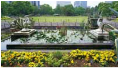
First flower garden