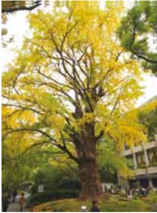
Kubikake ginkgo tree

Health field ● This 2,200m 2 field has equipment for measuring strength and for physical training. People from the business district stop by at lunch to work on improving their health.