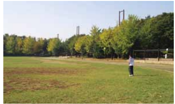
Wide open athletic field

Playground and children's field ● The Sakuragawa section is lower in elevation than the other sections, making it almost like a separated park annex. It is made up of a round playground with play equipment and a children's field. Many tall trees such as ginkgos, zelkovas, and cherry trees dot the area making it perfect for a stroll.