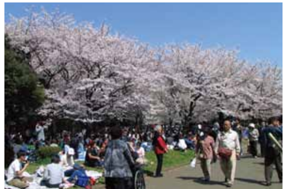
800 someiyoshino and other cherry trees in the park

trees, unusual crape myrtle woods, large buttonballs, Japanese zelkovas with their widely spread branches, large soapberrys and Japanese honey locusts, fleetingly beautiful cherry trees, camphor trees that are green in winter, a forest of Japanese chinquapin, and more.