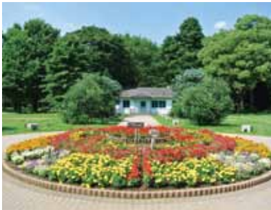
Olympic memorial hall

● This pedestrian bridge linking the forest and facilities sections of the park doubles as an observation deck. It spans 145 meters, is 6 meters wide and 6 meters high. The observation deck part is slightly wider, and provides a view of the entire forest section of the park.