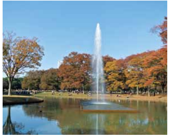
Autumn scenery of the fountain backed by colored leaf