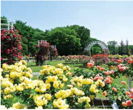
A waltz of gorgeous roses