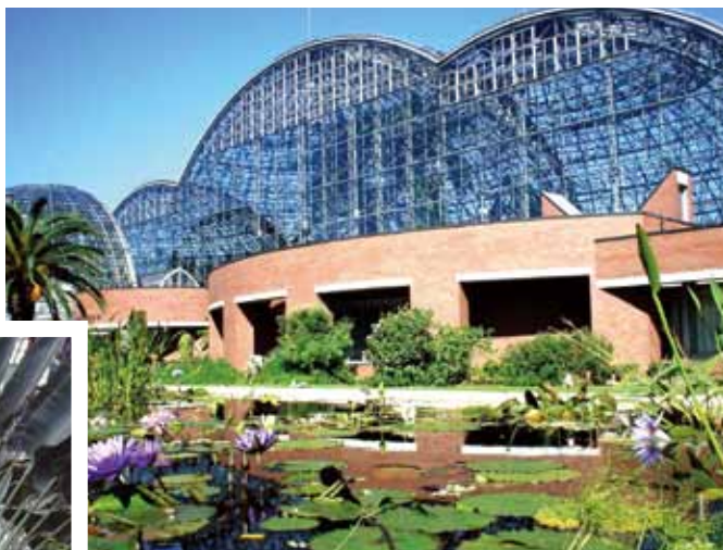
Eye-catching glass domes

A corner where green pepes are on display and you can also interact with plants and experience the fun of woodwork. It also provides living information through displays of bioecology such as those of catfish, special photo exhibits, and special exhibits.