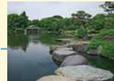
A precious stone

Tokyo Metropolitan Government designated Place of Scenic Beauty