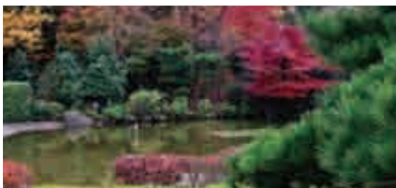
Japanese garden in autumn