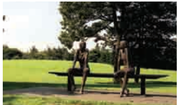
Anne & Michele, one of the sculptures in the park

A full range of exercise facilities for jogging, baseball, tennis, soccer, and more are provided. Those help the park in its role as a place for family sports with forest, hills, and water surrounded by greenery. There are also a childrens playground equipment and water play area, a multi-use field forming a slope, and other facilities. The Fuchu Art Museum opened on the north side of the park in 2000, adding art appreciation to the many ways to enjoy the park such as sports and strolls through the bright green of the tree groves. Eight sculptures by notable artists are located throughout the park.