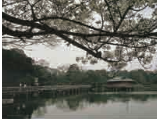
Otsutaibashi bridge & island teahouse on the tidal pond