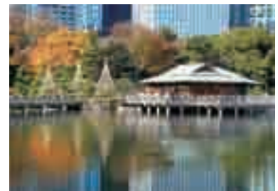
Trident maple in autumn color and the island teahouse

Tidal pond ● The water in the pond is seawater. Locks are opened and closed according to the rise and fall of sea levels on Tokyo Bay, adjusting the flow of water in and out of the pond. Saltwater fish such as flathead mullet, Japanese seabass, goby, and eel live in the pond. Crabs and wharf roaches with barnacles can be found crawling on the rocks around the shore. Birds such as white and grey herons are also seen dancing across the water.