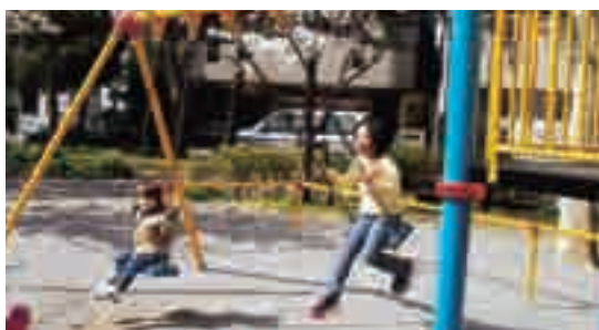
Swings in the warm spring wind