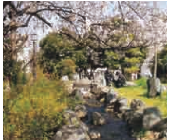
The full bloom of spring

The park is equipped with a baseball field, tennis courts, martial arts hall, heated pool, and other facilities to make it a sports-oriented park. It is gaining much attention as a park for people of all ages to enjoy.