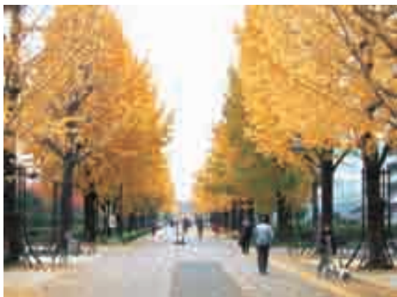
Interaction path (ginkgo trees)

Water view facilities ● The water-themed facilities were donated by the Japan Lottery Association in 1992 and installed in the zelkova field to the east of the administration center. They include a fountain, waterfall, and stream, and are used as place for children to play in the water in the summer.