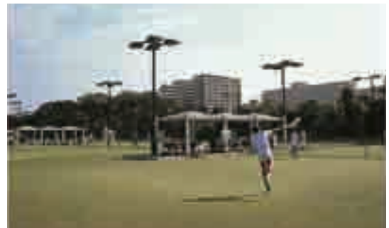
Relaxing benches one attraction for the eight-court omniscourt

Odd numbered days: Western archery Even numbered days: Japanese archery Range charge: 210 yen Equipment rental: 140 yen Inquire at the archery range about range use (tel: 03-3976-8151).