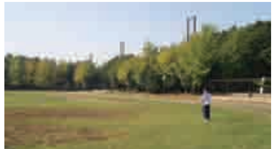
Wide open athletic field

The predecessor of the park was an air-defense green zone constructed in 1942. After the war, it was implemented into the urban park plan and opened as Kami-itabashi Green Zone in 1957. The current name was adopted in 1970.