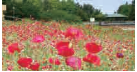
Poppies (middle of May through June)