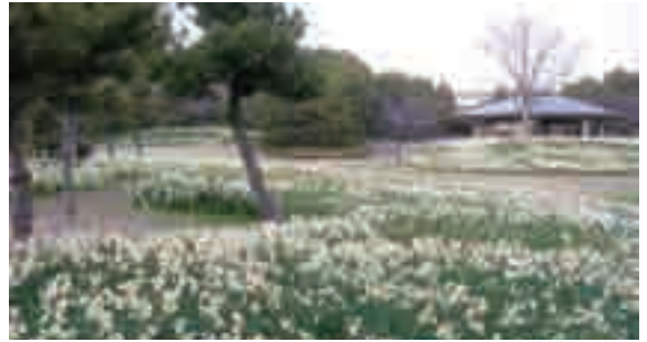
Narcissus (end of December through February)

Administration center, etc. ● Visitors to the park area welcomed by this entrance zone. The Kasai Rinkai Park service center, station-front plaza and fountain, promenade to the sea, parking lot, and other facilities are located here.