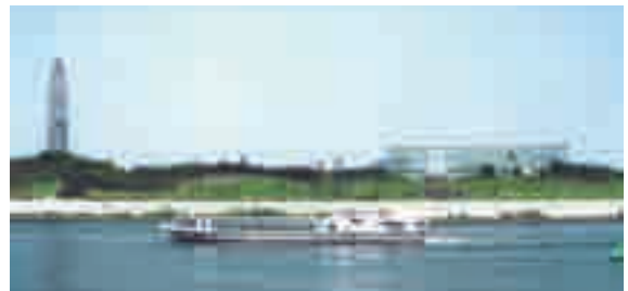
Giant Ferris wheel, marine bus, Tokyo Mizube Cruising Line, and observation restaurant viewed from the west beach

Grass field ● A lotus pond, walkway, trees, rest house, giant Ferris wheel and lodging facilities are located at the center of the gently sloped grass field.