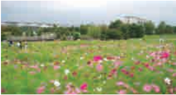
Cosmos (end of August through October)