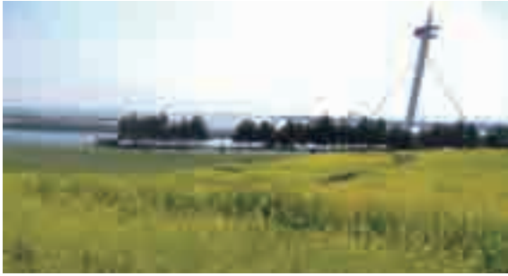
Rape blossoms (end of March through April)