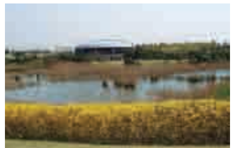
Bird watching center viewed from the freshwater pond

Bird sanctuary ● The bird watching center that forms the main facility here has an information corner where you can see videos and exhibits about birds. There are also two ponds, an observation building, observation window, and other facilities to view birds in nature. This oasis in the city provides a home for a variety of creatures.