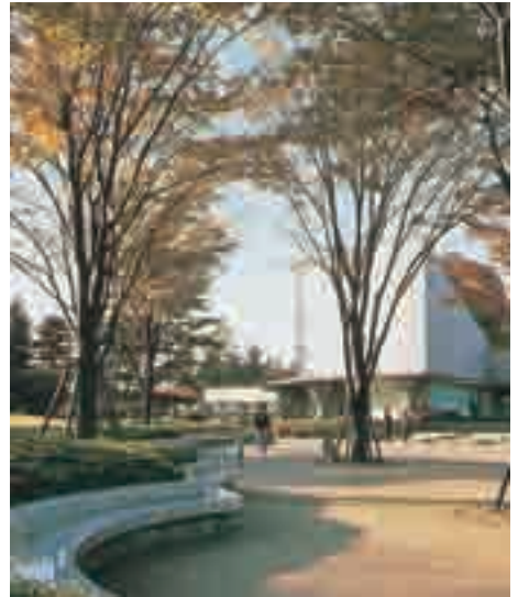
Plaza in front of the art museum

Art museum ● Setagaya Art Museum opened in a corner of the park in March 1986. The museum features a tiled exterior and open atmosphere created by the bronze roofed vaulted dome.