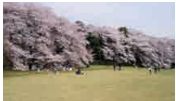
Family park with cherry blossoms in bloom

Cycling course ● A 1.75 km course circles the family park. Anyone can bring a bicycle to enjoy a ride on the path. Come enjoy a leisurely ride on the course and enjoy the gentle breeze.