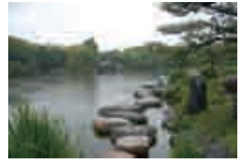
Teahouse behind the stepping stones

Pond ● Three islands are situated on this wide pond, the main attraction of the gardens with its islands, sukiya-style building, and trees reflecting on the water. Water used to be drawn from the Sumidagawa River, and the scenery was said to have differed slightly by the tide. Today, water is supplied by rainwater.