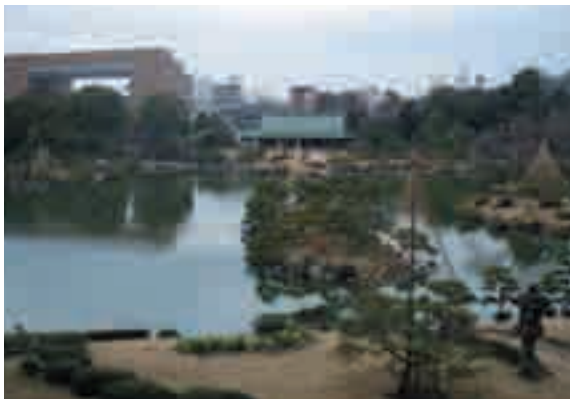
View from Mt. Fuji

Mt. Fuji ● This is the highest artificial hill in the garden. Before the earthquake, instead of planting trees near the hilltop, several rows of bushes such as satsuki azaleas and azaleas were planted to render the image of clouds floating above Mt. Fuji.