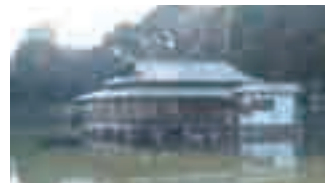
Open-walled teahouse used for gatherings

The open-walled teahouse was originally built by the Iwasakis to host British dignitary Marshall Kitchener who visited Japan in 1909. It survived earthquake and war, still standing today. Complete renovation was carried out in 1985, and it was designated a historical structure by the Tokyo Metropolitan Government in 2005.