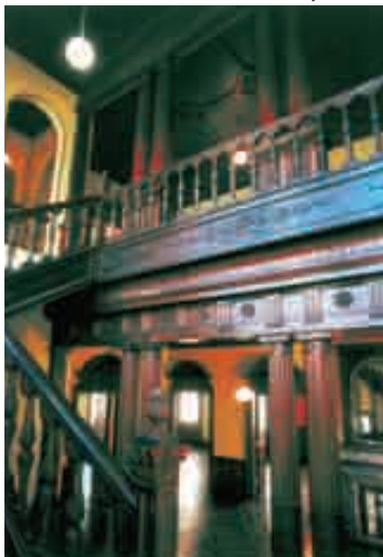
Grand staircase of the western-style house