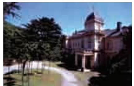
Front of the western-style house

A veranda with a line of pillars is located on the south side, a colonial touch developed in southern territories. The first floor exhibits Tuscan style and the second floor Ionian style characteristics. Seamless English Minton tile sets the first-floor veranda apart other structures.