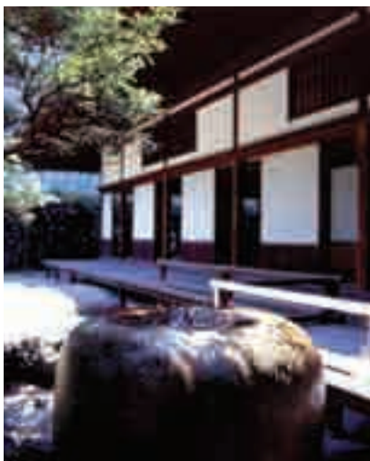
Shoin style garden's large stone wash basin

Japanese-style house ● The Japanese-style house connected to the western house is based on the classic shoin style. At the time of completion, the house had a floor area of about 1,800 m 2 , making it comparable in size the western house. The head carpenter is said to have been Kijuro Okawa, a famous craftsman who created many residences for notables in the Meiji government and the financial circles. The Japanese-style house remaining today was used for Iwasaki family affairs, and is covered with motifs of the three-diamond mark that was the Iwasaki family crest. Visitors are given a glimpse of pure Japanese-style architecture of the day through areas such as the main hall with its Japanese painting (Mt. Fuji and waves) by Gaho Hashimoto.