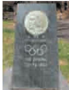
Relief of Baron Pierre de Coubertin

● Restroom ★ Restroom with wheelchair access