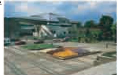
Tokyo Metropolitan Gymnasium

Neighboring highlights ● Rows of ginkgo trees stand in front of the Meiji Memorial Picture Gallery. When ginkgos lining the road change color, they form a golden tunnel.