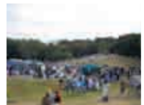
Musashino Harappa (field) Festival

A variety of events are held here every year during summer vacation. Local residents use Wanpaku field and the riverside to carry out those events.