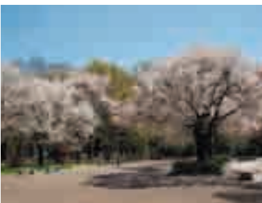
Plenty of cherry blossoms

The Musashino Nursery raises around 4,000 trees and shrubs of 65 species, including Japanese zelkovas and stone oak. It also conducts surveys, research, and tests on the growth of trees.