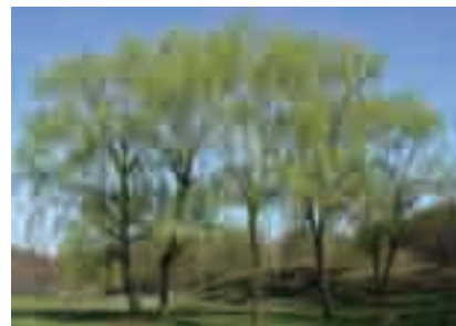
Large trees at the base of Kujirayama Hill that provide shade in summer

Kujirayama Hill ● Named for its shape like a whale ( kujira ) back, this small hill covers part of the park. It overlooks the hake cliff line on the other side of Nogawa River. Wanpaku (rascal) field, an open grassy area, extends across the north side.