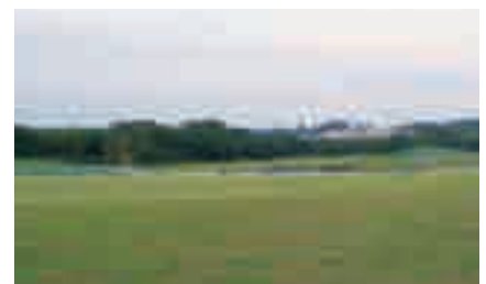
Large grassy field