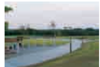
Overlooking a pond for water supply use in disasters