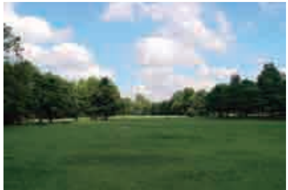
Great lawn under a broad sky

Grass fields ● The grass fields that were once a golf course are shaded by mixed woods of trees such as sawtooth oak and konara oak and groves of cercidiphyllum japonicum, trident maple, camphors, Japanese zelkovas, and others. The fields are separated into areas with names such as rest field, children's field, great lawn, and free field. They are used for picnics, resting, and other activities. Of the various fields, the children's field has 31 types of wooden playground equipment. That allows for a variety of athletic activities.