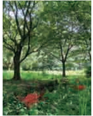
Enjoy the seasonal flowers at the nature observation garden

Volunteers protect and manage the precious nature of the park. Today, 100 people are active in all four seasons. The center is open every day from 9:30 am to 4:30 pm except Mondays.