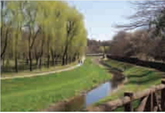
Nogawa river in the springtime

Nature observation center ● This facility where visitors to the nature observation garden can participate in exhibitions and learn about living with nature was opened along with that garden. Exhibitions and lectures on nature and culture centering on Nogawa River and Kokubunji cliffline are conducted, and events such as nature observation tours held.