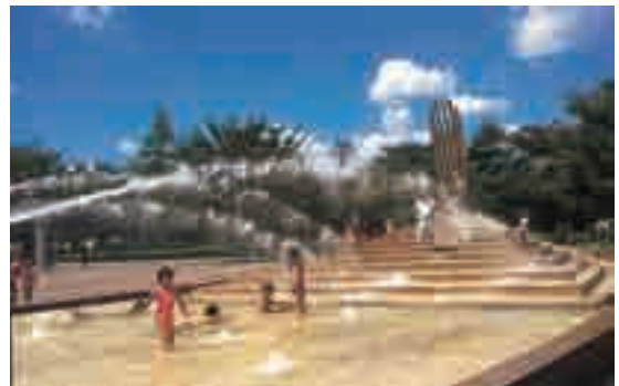
Water square (rainbow pond)

The park has a pond that makes lavish use of water, befitting the name Oizumi, which means large spring in Japanese. It also has a baseball field, athletic field, sunny field, and other facilities for sports and recreation under the open sky. Oizumi-Chuo Park is known as a park where everyone from small children to the elderly can have fun in safety and comfort.