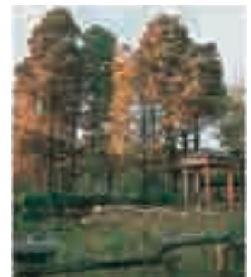
Bald cypress forest

Wild grasses ● Plants not usually found on the forest floor grow here. Communities of plants such as large Periwinkle and jumpseed as well as Japanese fairy bells and carpet bugles can be seen.