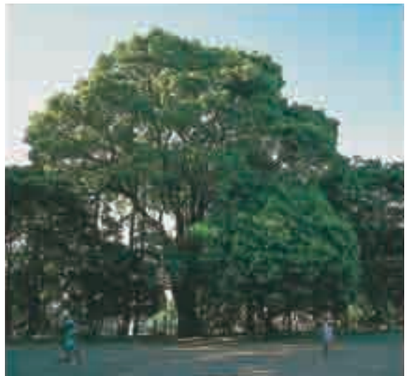
Overwhelming camphor tree

Giant trees ● With the site's history spanning more than a hundred years, there are many trees with trunk circumferences of more than three meters. Those include Japanese zelkovas, camphors, poplars, and buttonballs that form a tall skyline. Of those, the big camphor in the grass field presents an overwhelming display and is the symbol of the park.