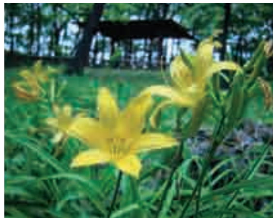
Musashinokisuge daylily in bloom from late to early May

Tree groves ● Sengenyama hill has three crests: Maeyama, Nakayama, and Doyama. All three of those are covered with groves of trees that evoke images of old Musashino such as konara oak, sawtooth oak, and carpinus. The trees used to be used for firewood by local farmers, but today they are protected as precious scenery.