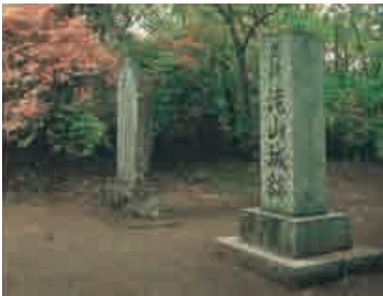
Monument commemorating Takiyama Castle

Sadashige Oishi, a descendent of Heian era general Yoshinaka Kiso, is said to have built Takiyama Castle in 1521. The castle was occupied by the Oishi and Hojo families until Ujiteru Hojo built Hachioji Castle in 1573. It is a typical mountain castle that utilizes the bluff on the river side. Remains of the keep, second compound, hall, dry moat, and other components can be seen today. The site was designated a historical monument in 1951.