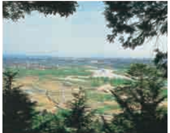
View of the Tamagawa River