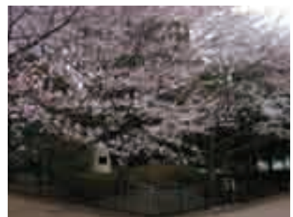
Reagan Cherry Tree (returned someiyoshino)