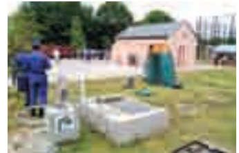
Family field: Disaster well and makeshift toilet

Other facilities include a disaster well and benches that can be converted to make cooking spaces.