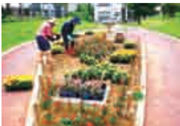
Working on the flowerbeds at garden park (flowers in bloom)

Seasonal flowers ● The park features a flowering grass field and garden park where local residents help raise flower beds. Thanks to the cooperation of volunteer park workers, visitors are able to enjoy the park through flowers that reflect the color of the seasons.