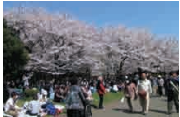
800 someiyoshino and other cherry trees in the park

Japanese honey locusts, fleetingly beautiful cherry trees, camphor trees that are green in winter, a forest of Japanese chinquapin, and more.