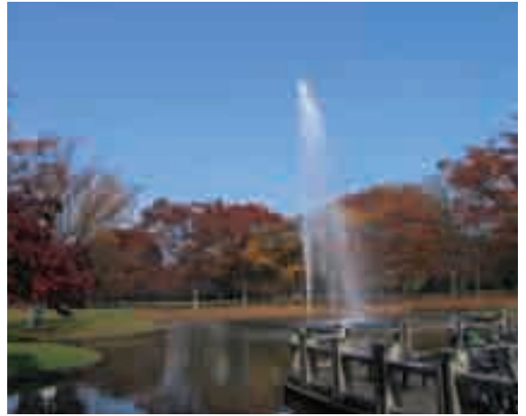
Autumn scenery of the fountain backed by colored leaves

Other monuments ● Many monuments dot the park. Those include the Olympic monument, Olympic memorial hall, Empress Dowager Shoken monument, memorial to the 14 men who committed suicide to take responsibility for the war, Quetzalcoatl statue donated by Mexico, statue of happiness, and monument to greening of Japan.