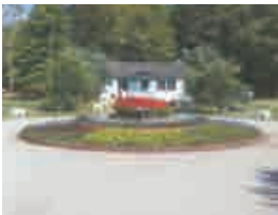
Olympic memorial hall

Other monuments ● Many monuments dot the park. Those include the Olympic monument, Olympic memorial hall, Empress Dowager Shoken monument, memorial to the 14 men who committed suicide to take responsibility for the war, Quetzalcoatl statue donated by Mexico, statue of happiness, and monument to greening of Japan.