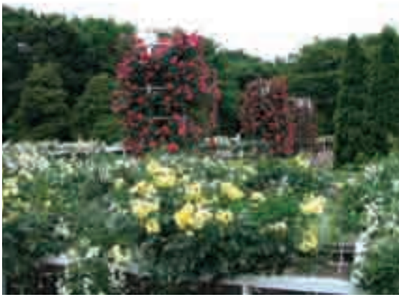
A waltz of gorgeous roses