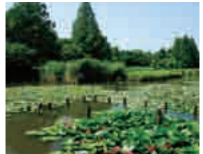
Water lilies on the lower pond

making it more rustic than the upper pond.